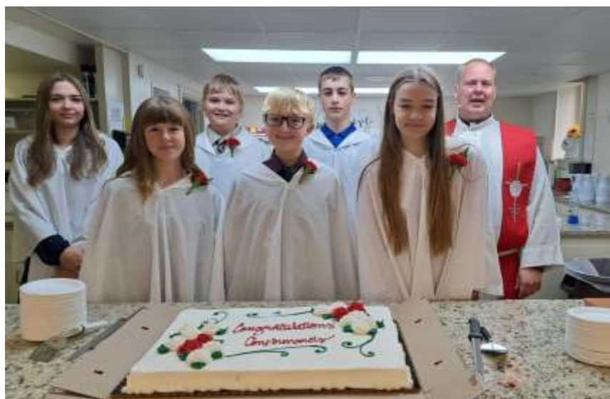
Congratulations to our newest confirmed members of East Koshkonong!